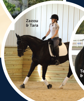
Zazou & Tara

A few of the HEALTHY HORSES & HAPPY RIDERS we support